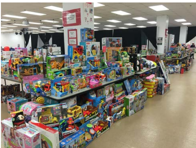
Toys awaiting shoppers after expert volunteer staging at the Elgin Holiday Toy Giveaway.