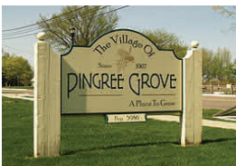
Pingree Grove had a population of 124 in 2000 and is now more than 4500.

The Crisis Center has received a grant to support counseling in growing rural areas of Kane County. As a result, Domestic Violence counseling is now available closer to home for residents of Pingree Grove, Hampshire, and Carpentersville. To schedule at any of these places, call the Crisis Line at 847-697-2380. We continue to offer counseling services in Streamwood and St. Charles as well as in Elgin.