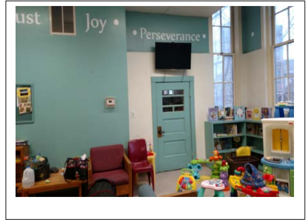
Shelter community day room

Children's Program Our mission is to provide a safe, nurturing environment where children are free to express feelings, play peacefully, learn non-violent behaviors and begin to understand the dynamics of domestic violence. Services provided by the staff include: Case Management; Individual Children's Counseling; Children's Group Counseling for shelter residents which includes: Children's DV Support Group, Play Groups, Homework Group, Games & Craft Group, Children's Group Counseling for walk-In clients; and a Parenting Group.