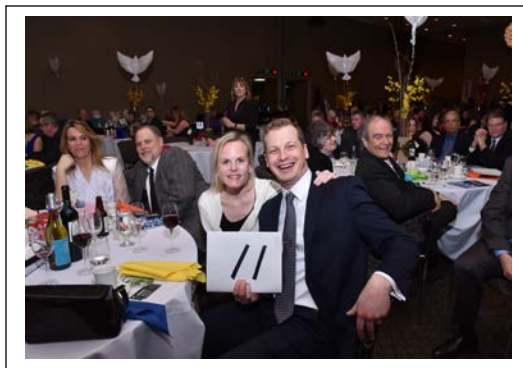
Live Auction Winners!

April 2017 Sexual Assault Awareness Month is an annual campaign to raise public awareness about sexual assault and educate communities and individuals on how to prevent sexual violence. Crisis Center activities included public information tables at Elgin Community College, area libraries and The Centre of Elgin and the presentation of Eve Ensler's play, "The Vagina Monologues" on May 11 th at Elgin Community College; the Obie award winning play that explores women's forbidden zone.