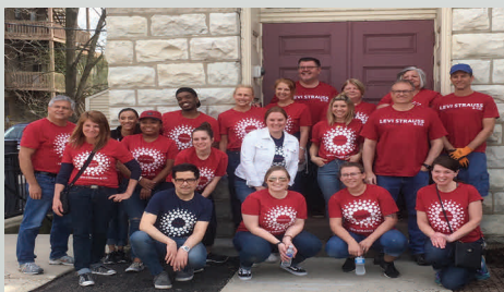
Levi Strauss Employees after a hard days' work

19 Levi employees spent the day at the Crisis Center cleaning up our outside property and organizing our food & supply areas.