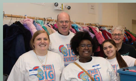
ECC volunteers & CCC staff.

Four ECC students and employees spent several hours organizing our Winter Coat Closet.